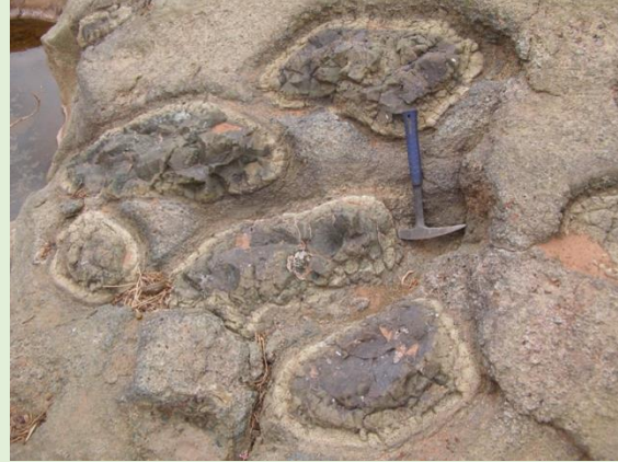
Dispersed pillow lavas associated with hyaloclastites at the Central Atlantic Magmatic Province (CAMP, High-Atlas, Morocco)

International Dyke Conference (IDC 8)-Large Igneous Provinces (LIPs 8)-Rodina 2023 29<sup>th</sup> May-16<sup>th</sup> June 2023 Marrakesh (Morocco)